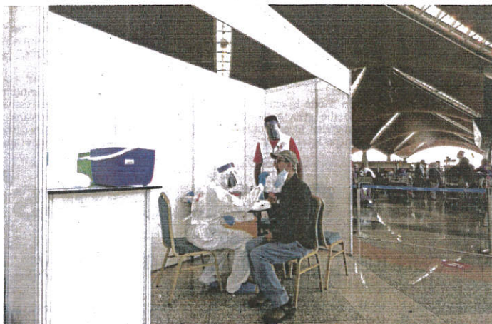
Easy does it: A health worker carrying out an RT-PCR Covid-19 test at KLIA.

A senior official said there were four different health service providers at four international airports – KLIA, Penang International Airport, Kota Kinabalu International Airport and Kuching International Airport.