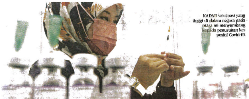
KADAR vaksinasi yang tinggi di dalam negara pada masa ini menyumbang kepada penurunan kes positif Covid-19.