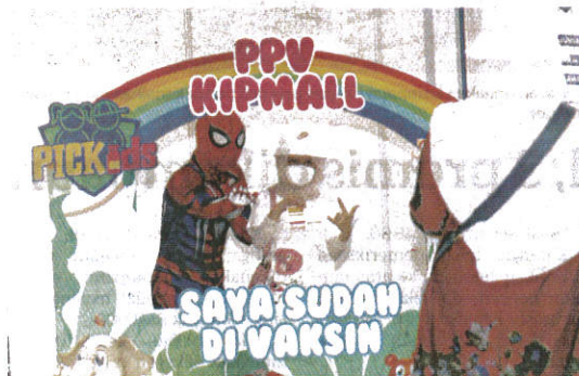
GELAGAT 'Spiderman' menceerikan kanak-kanak yang mengambil suntikan vaksin di Kipmall Melaka pada 16 Februari lalu.

Kanak-kanak tersebut bukan sahaja mendapat gejala ringan, tetapi ada antara mereka mendapat gejala serius sehingga dima-