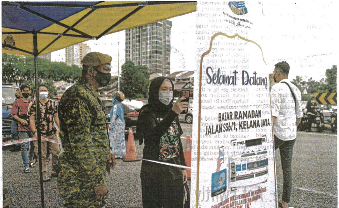
Visitors wearing face masks checking in via MySejahtera at the Kelana Jaya Ramadan bazaar recently.