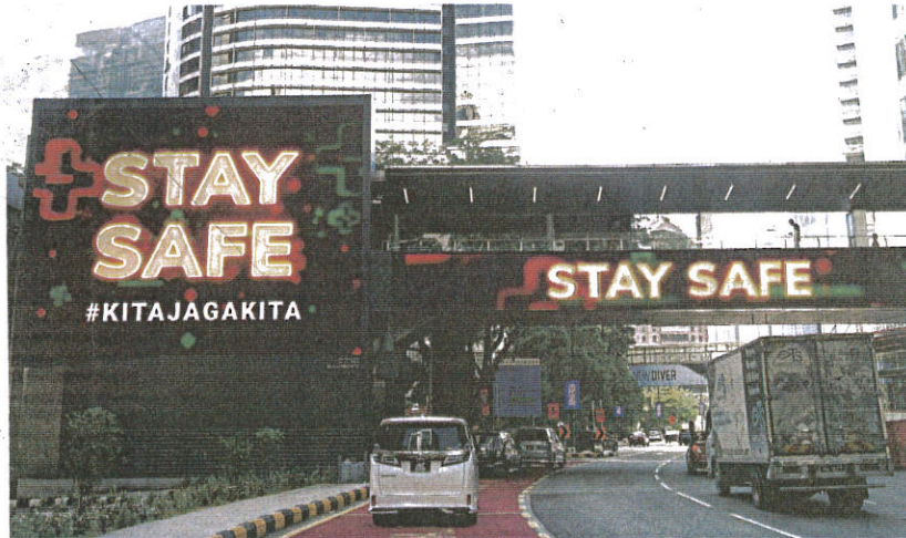
Daily reminder: Experts noted that authorities should be on guard and increase surveillance as the Omicron XE variant is 10% more infectious compared to the current strain.

"What we have to focus on now is to ensure coverage of vaccines among those aged five to 11, booster shots to achieve coverage of at least 70% to 80%, and provision of specific care for children less than five-years-old as well as those unable to be vaccinated," she said.