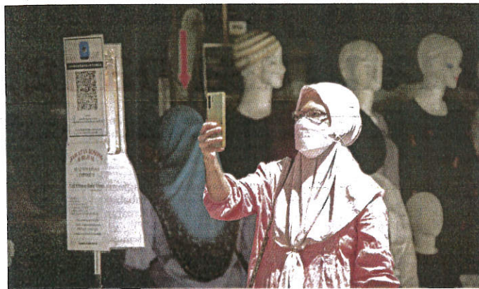
SEORANG pengunjung mengimbas kod QR MySejahtera sebelum memasuki premis di Jalan Tuanku Abdul Rahman di ibu kota, semalam. Rakyat harus mematuhi prosedur operasi standard (SOP) seperti memakai pelitup muka bagi mengelak penularan Covid-19.

Saran orang ramai terus waspada di fasa endemik